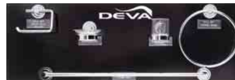
DIS 39 Accessories EPOA