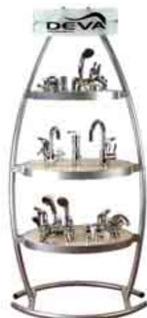
DIS 360 360° view free standing unit EPOA