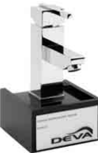
DIS 001 Acrylic table top display EPOA