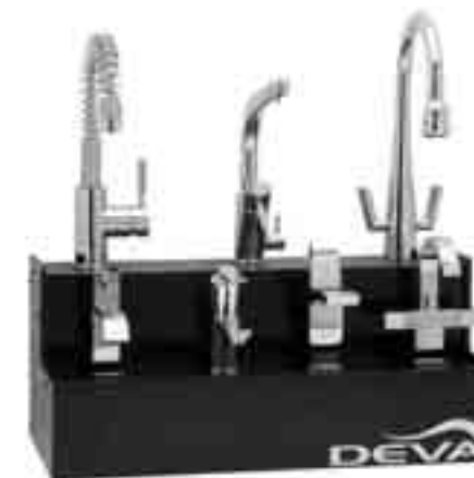
DIS STEP Counter top stand EPOA