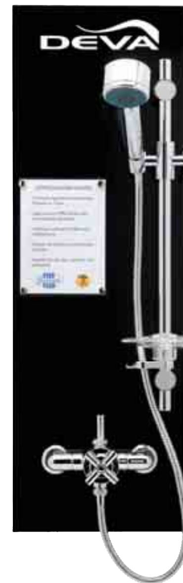
DIS 39 Wall mounted shower display EPOA